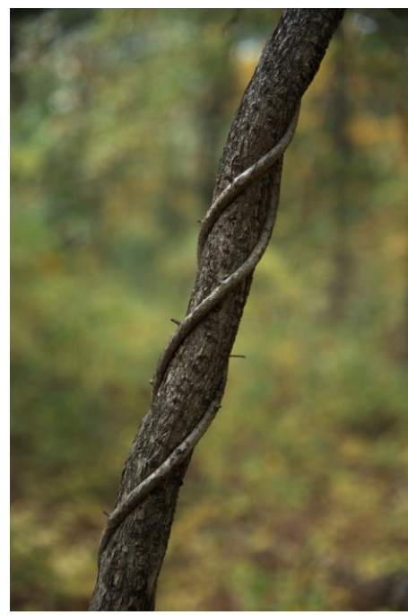
Bittersweet strangling trees in the Cox/Walker conservation land.

Groton has been invaded by a foreign plant: oriental bittersweet ( Celastrus orbiculatus ). This vine grows fast in sunny areas, wraps itself around trees, and strangles them. In areas where bittersweet has taken hold, it kills our native trees and keeps new seedlings from growing.